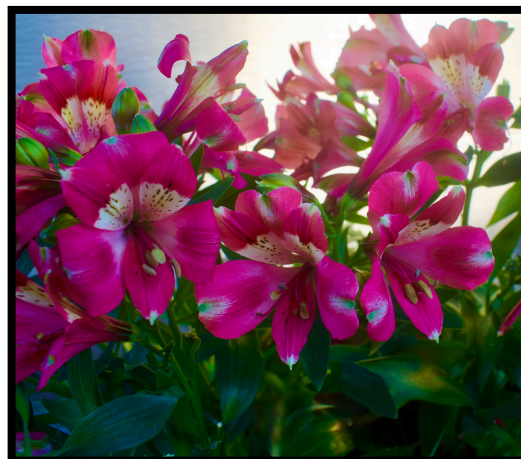
Peruvian Lilly or Alstroemeria

"It is faith that connects us with heaven and brings us strength for coping with the powers of darkness. In Christ, God has provided means for subduing every sinful trait, and resisting every temptation, however strong. But many feel that they lack faith, and therefore they remain away from Christ. Let these souls, in their helpless unworthiness, cast themselves upon the mercy of their compassionate Savior. Look not to self, but to Christ. He who healed the sick and cast out demons when He walked among men is the same mighty Redeemer today. Faith comes by the word of God. Then grasp His promise, 'Him that cometh to Me I will in nowise cast out.' John 6:37. Cast yourself at His feet with the cry, 'Lord, I believe; help Thou mine unbelief.' You can never perish while you do this—never." Desire of Ages, page 429