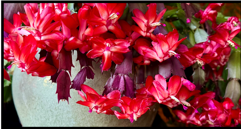
Christmas Cactus in full bloom.

On January 23, at 6:30 p.m., an opportunity is planned to gather in the church Chapel to read the entire book of Revelation out loud.