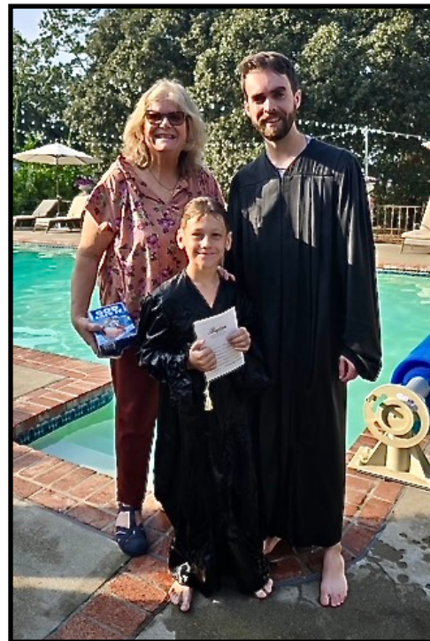
Photographer: Danae Brunner, top two and lower right