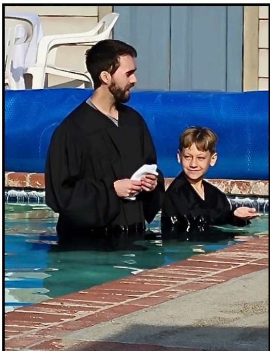
lower left