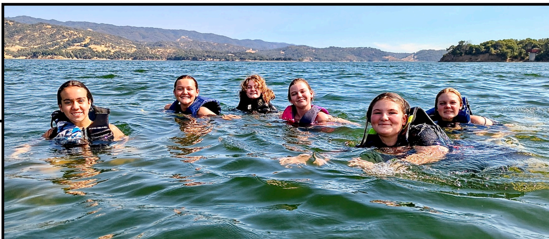
Photo: Swimming the waves at Stinson Beach