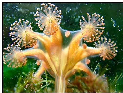
3. A stalked Jelly Sheldon found near the Albion Bridge.