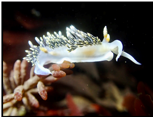
2. A new Nudibranch Sheldon found on Duxbury Reef.