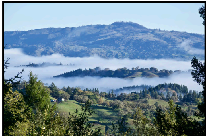
Hwy 101 goes north up the Willits Grade under the far layer of fog.