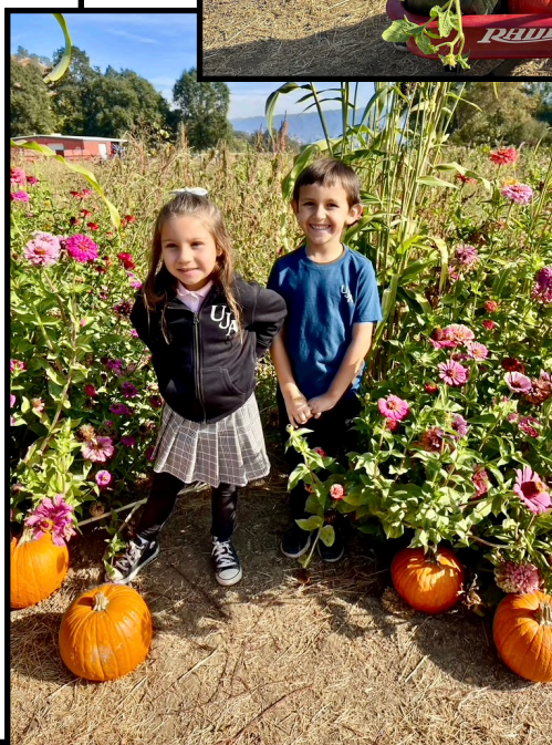
Pumpkin Patch on Boonville Road with the Kindergarten class