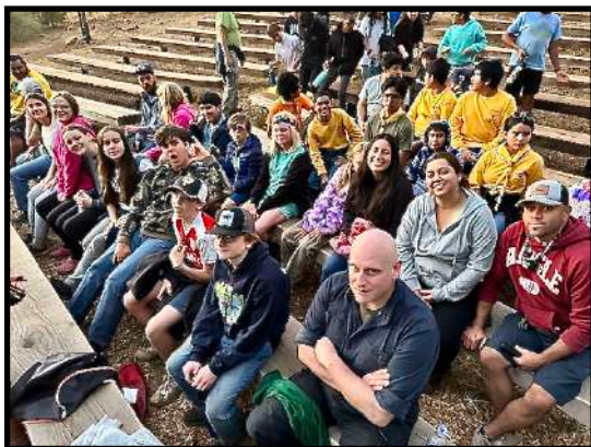
Left to right: 1. Our club at meeting time. 2. Pathfinder Parade. 3. Track cleaning.

Sunday morning everyone packed up and drove home, hopefully, leaving the campsite better than they found it. Everyone had a good time, bringing home a little dirt and a lot of fun memories.