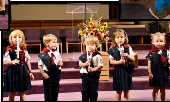
Photos taken of the Adventurer's Club Induction. They are all looking for more fun experiences in their club.