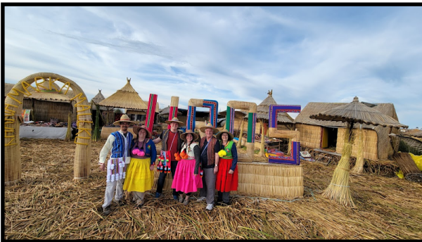
Left: Traditional garb of the Uros on the floating islands on Lake Titicaca