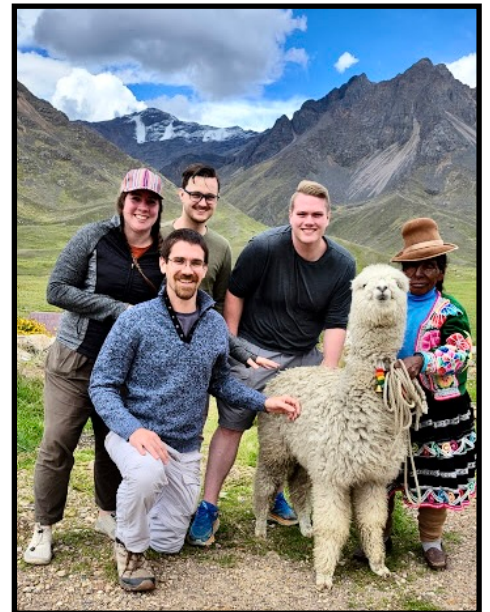
La Raya Pass at 14,222 ft elevation