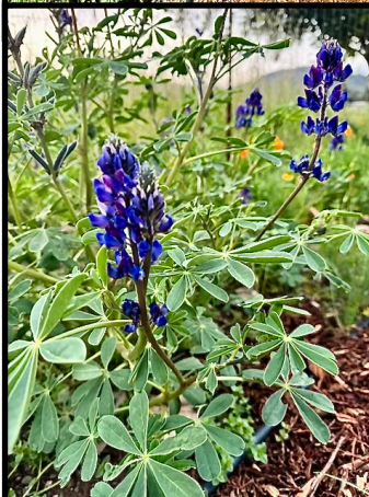
Photos of plants Left: The "invasive" strip Bottom left Wild Lupine that the Karner Blue butterfly eats Bottom right; Coastal Bush Lupine