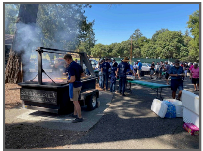
Above: Lining up to begin the day. Right: Ready for lunch after the tournament which was prepared by Savings Bank of Mendocino County.