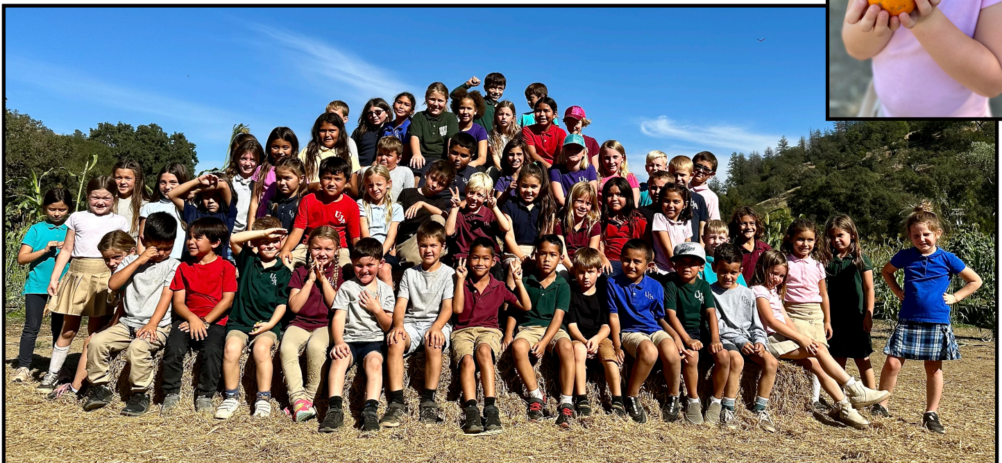
Below: Grades K thru 4