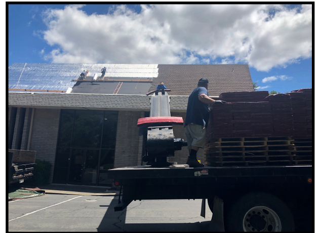
Men working on the steep roof.