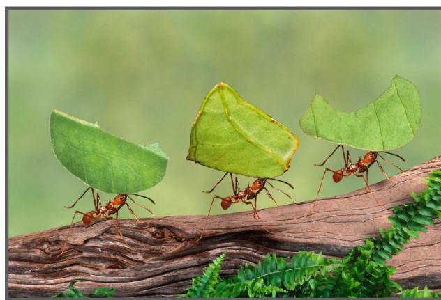
Photo above: Leaf Cutter Ants