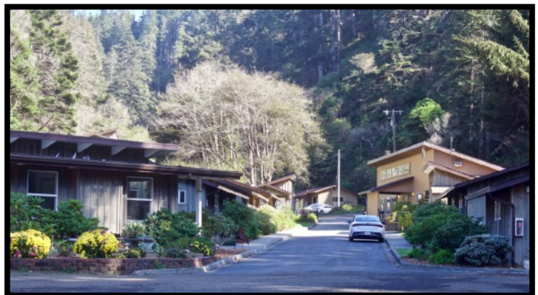
Albion Field Station