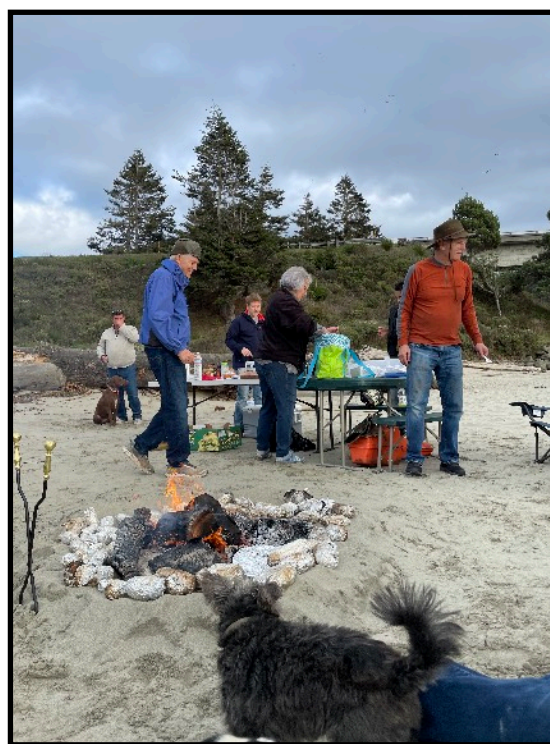
Potato roast at Big River Beach.