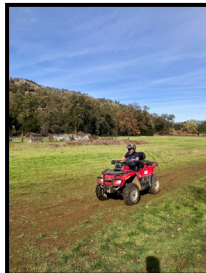
Youth and their ATV's.