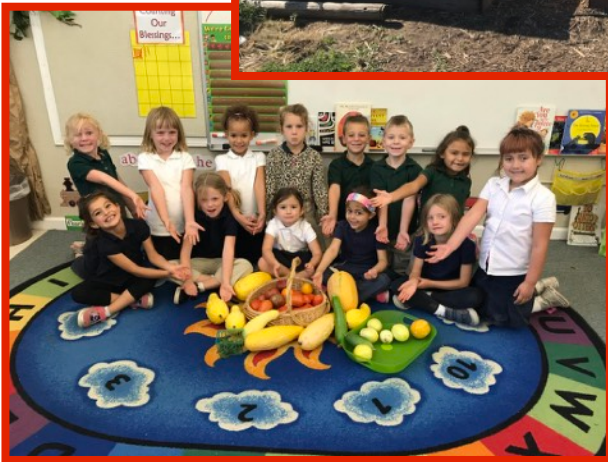
The Kindergarten Gardeners At UJA With their Produce