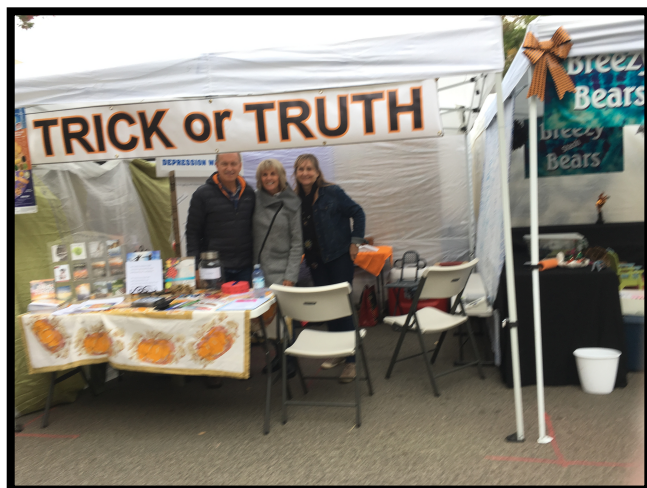
The TRICK or TRUTH BOOTH AT PUMPKINFEST