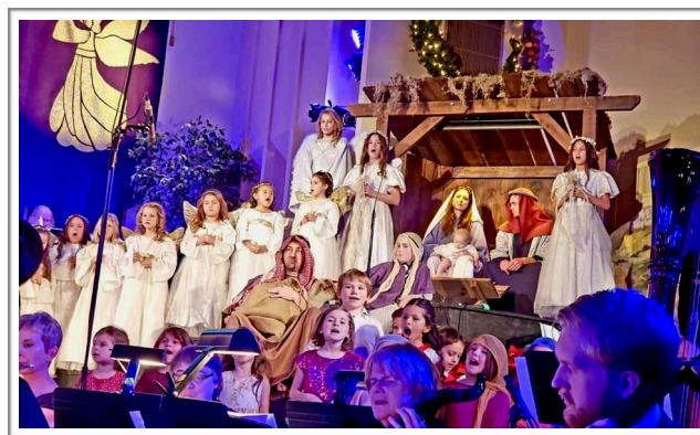
The Christmas Cantata