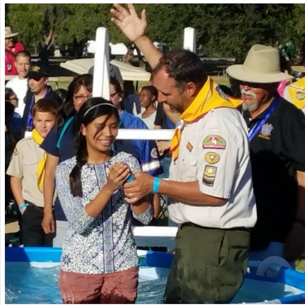
The Ukiah Pathfinder Club attended the Pacific Union Conference Camporee in Southern California near Temecula.