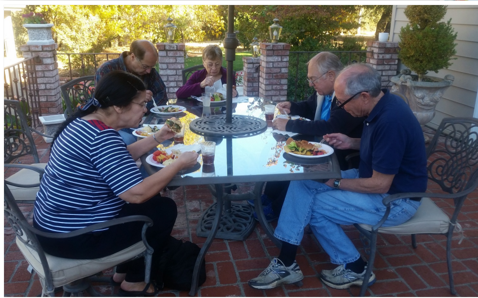
The "Great Disappointment" potluck at the Rice's home was held on October 22 in recognition of the infamous day in pre-Adventist history.