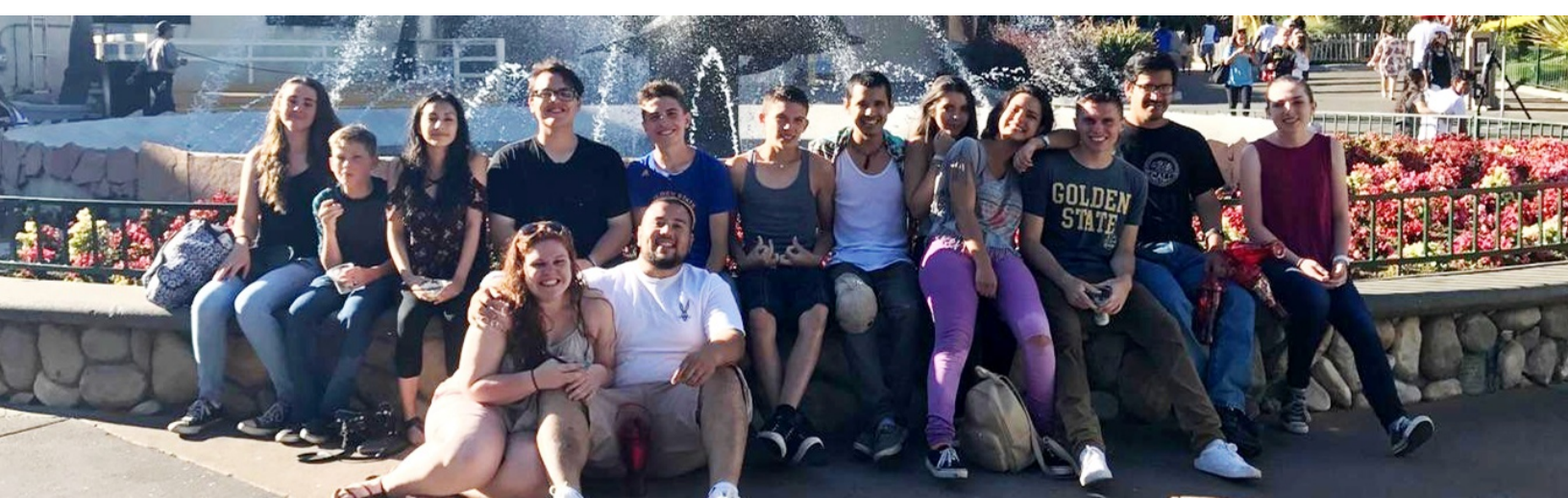
Church youth had a day's outing at Six Flags!