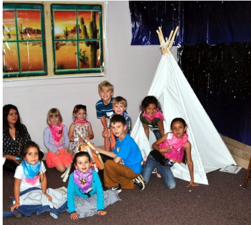
Vacation Bible School. See page 3 for more pictures.